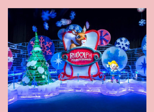
ICE! Through January 5, 2025 Gaylord Texan

For locations and more information, visit www.thelightpark.com